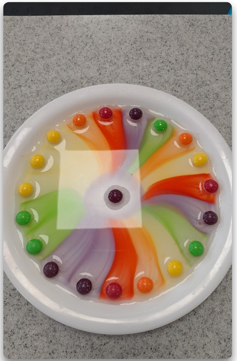
Year 10 students have been investigating how temperature can affect the rate of diffusion. They used skittles to demonstrate how quickly the colours would spread at different temperatures of water, with very colourful and beautiful results.

This week in science, Year 8 students have been investigating how the shape, rotor length and material properties of helicopters can affect their ability to fly. They used investigative skills and the scientific method in order to discover the most effective design for a helicopter.